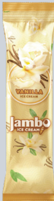
Vanilla Icecream 55ml