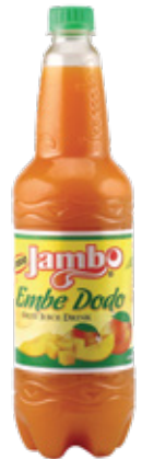
Embe Dodo 1 Litre