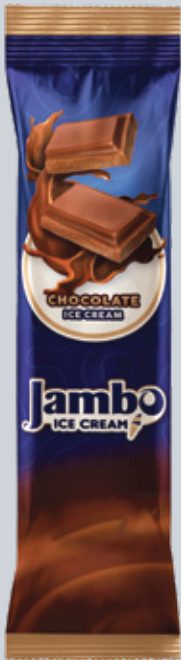
Chocolate Icecream 55ml