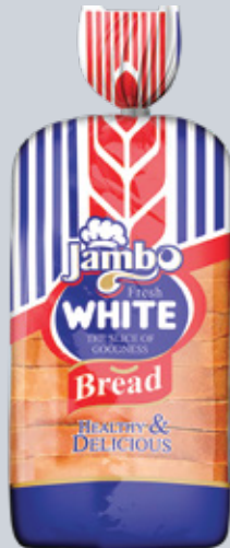
400g Loaf of Bread