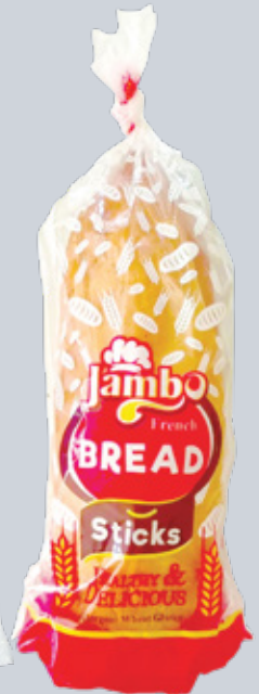
200g French Bread Sticks