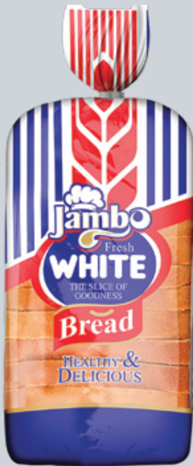
800g Loaf of Bread