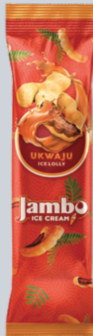
Ukwaju Lolly 75ml