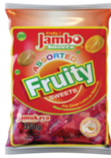
Assorted Fruity 350g