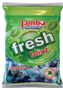
Fresh Mint 350g