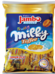
Fruity Milky Toffee 350g