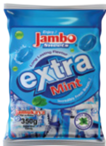
Extra Mint 350g