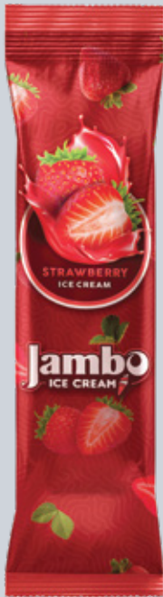
Strawberry Icecream 55ml