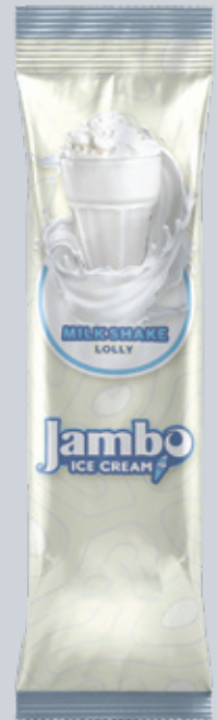
Milkshake Lolly 75ml