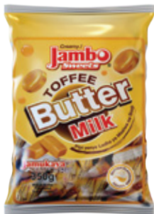
Toffee Butter Milk 350g